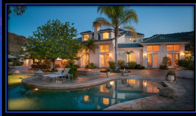
सपनो का घर