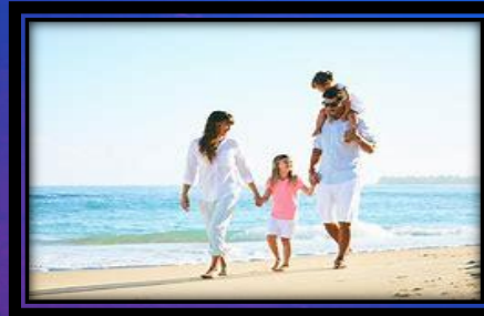
समय की आज़ादी